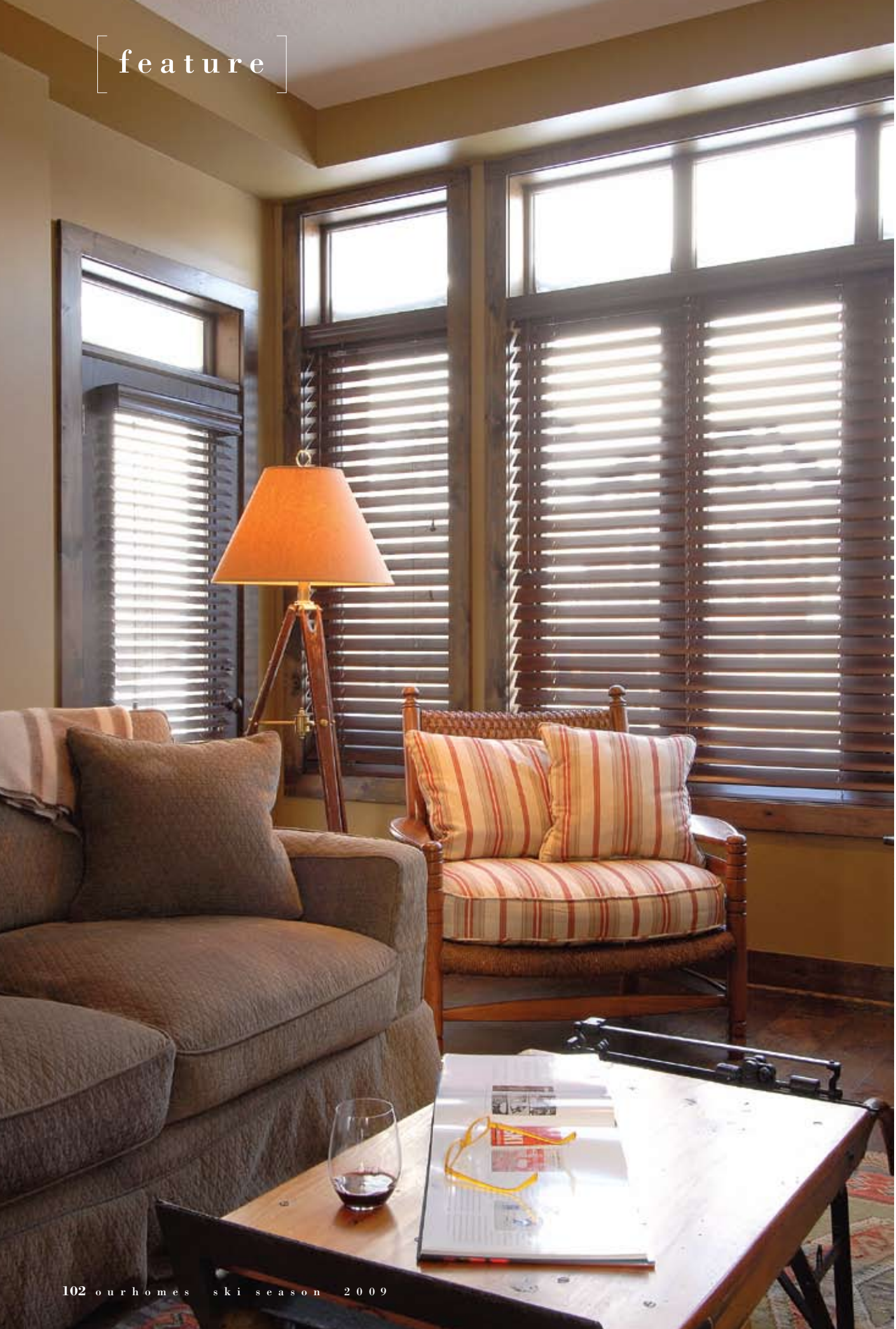
LEFT: A gas fireplace ensures the TV room is always warm and cosy.