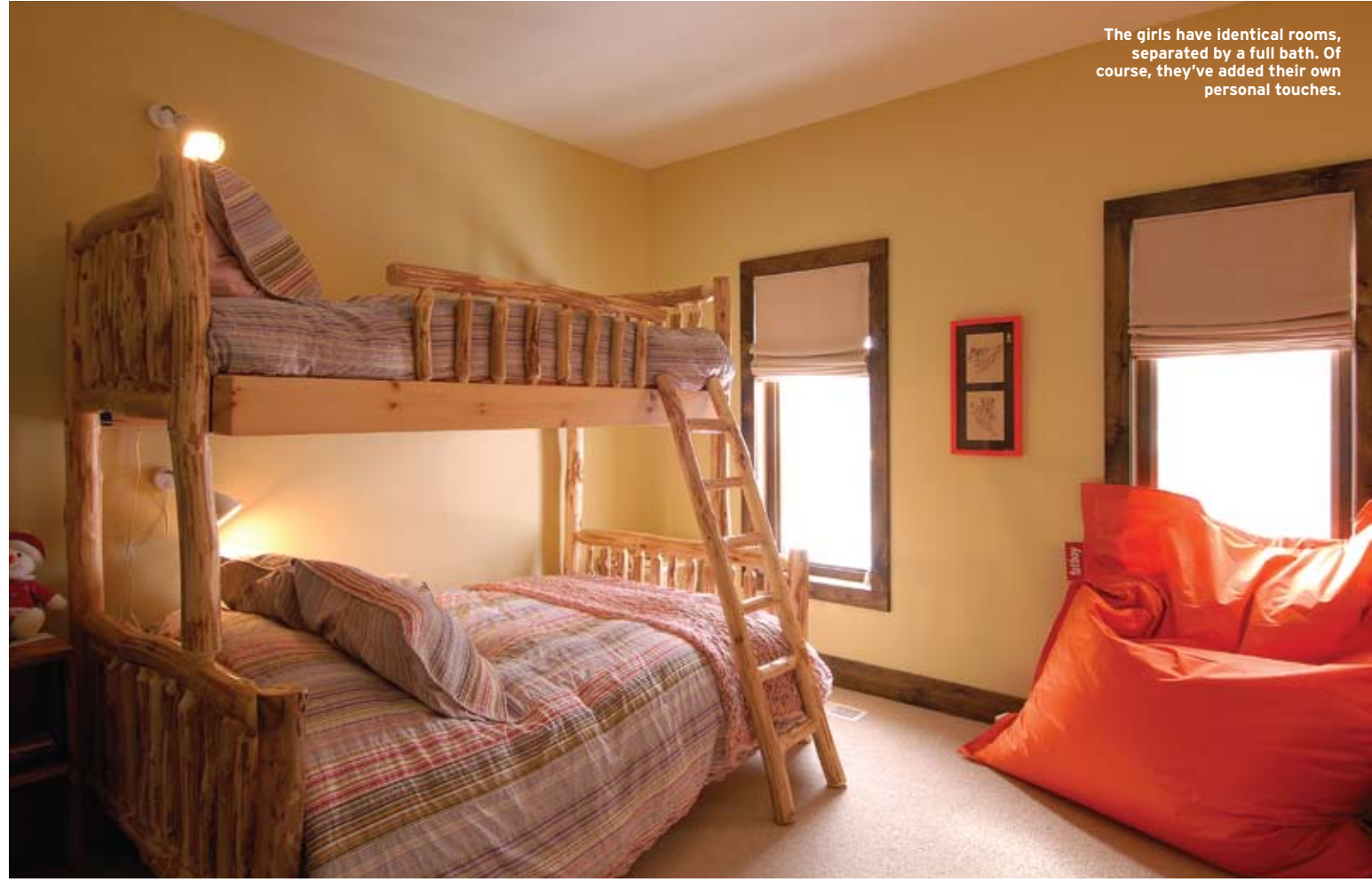
The girls have identical rooms, separated by a full bath. Of course, they’ve added their own personal touches.

“We’re huge outdoors people and we decided to buy here because we can walk to everything,” says Brigitte.