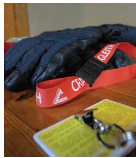
BELOW: Club cards and gloves are easy to find in the well-organized mudroom.

“We’re huge outdoors people and we decided to buy here because we can walk to everything,” says Brigitte.