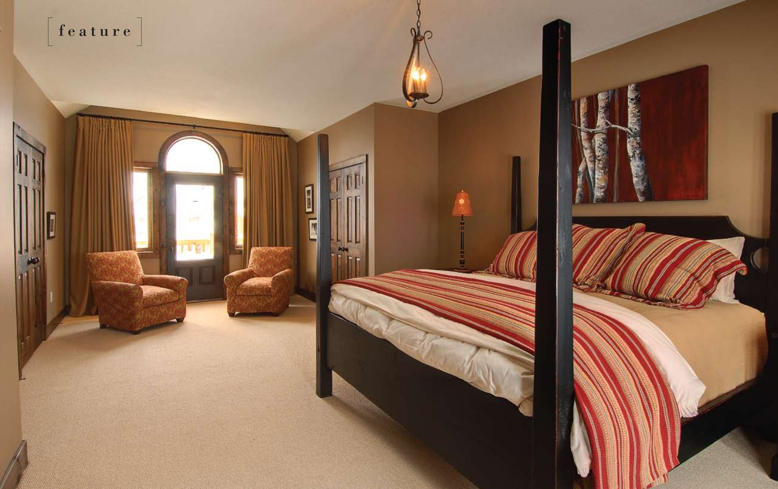
LEFT: The master bedroom is spacious and warm and has a view of the Craigleith Ski Club.