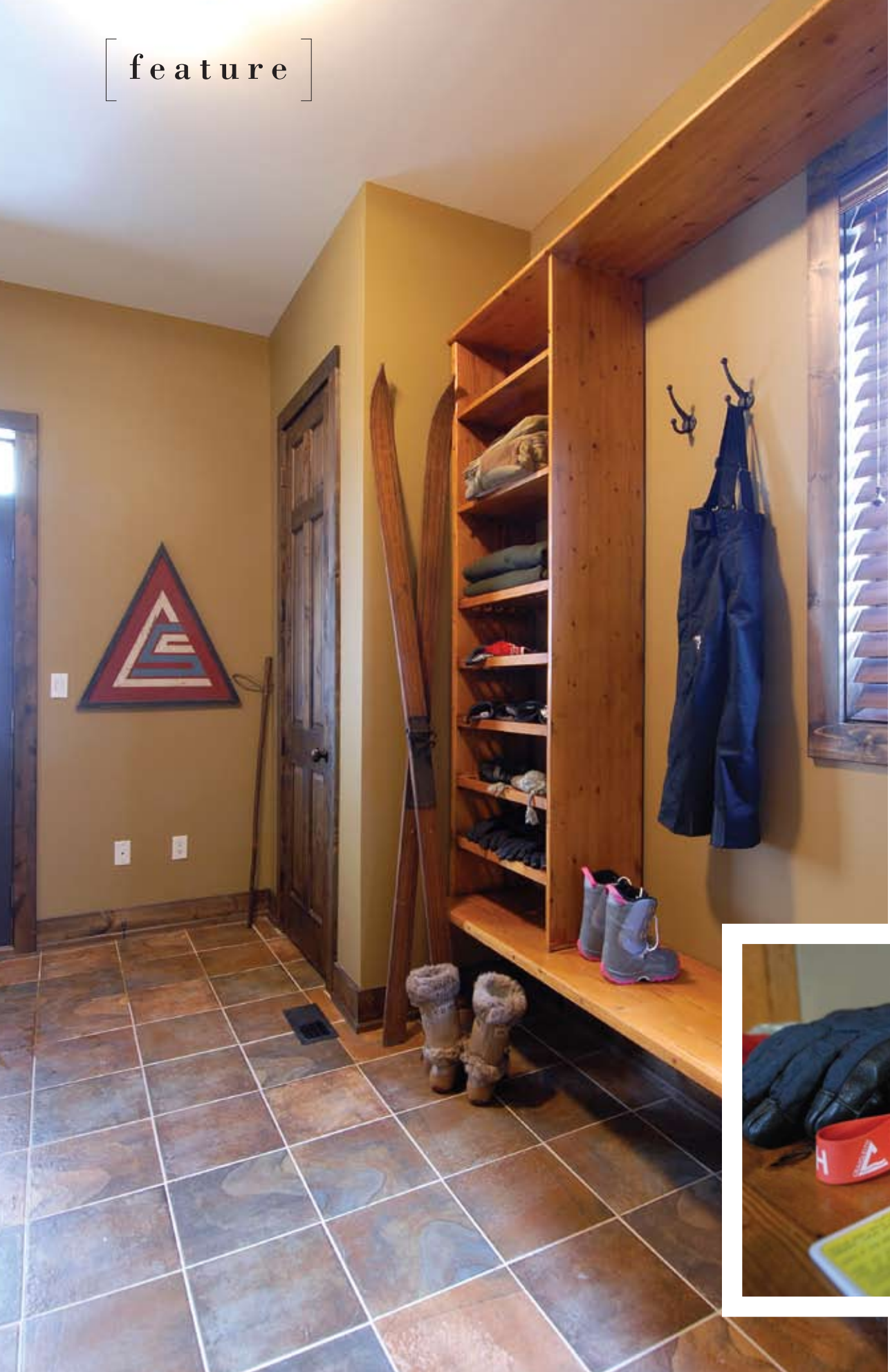
LEFT: The mudroom is a must in this busy home. There's plenty of storage for gear and it's a perfect drop-off zone.