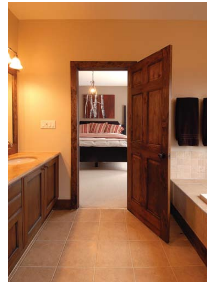
RIGHT: The master en suite is large and luxurious.

Chris and Brigitte upgraded practically everything in their abode, from the post and beam wood features and cathedral ceiling in the living room, to distressed, walnut-stained oak floors, to oversized windows and interior doors, with wood surround. “We upgraded floors, we upgraded windows, and we put in a wood burning fireplace in the living room instead of gas, because we retained the gas fireplace in the TV room,” says Chris.